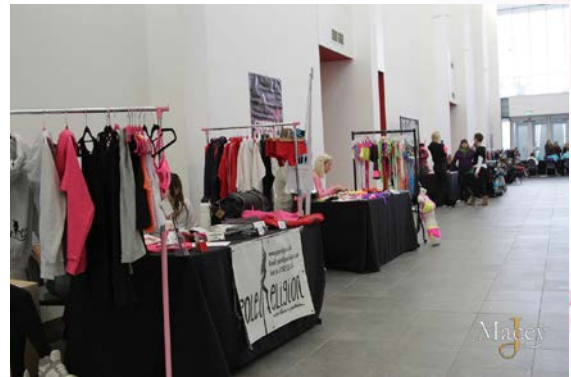
Our Sponsors' Marketplace

We are offering 4 tiers of sponsorship to provide you with a range of options to suit your business. If none of our packages suit your needs, please feel free to suggest an alternative. We are always open to new ideals from our sponsors!